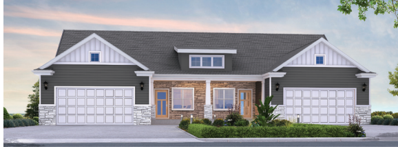
PLAN A - Offered with both exterior styles.