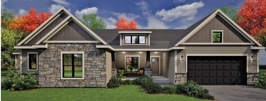
CONDO PLAN - C - LEFT