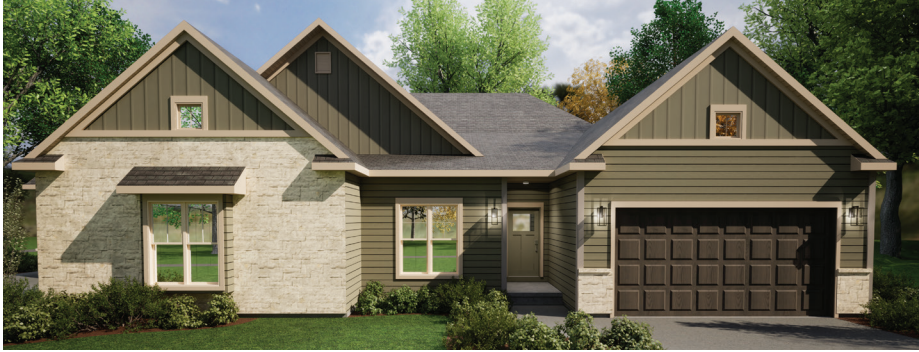
CONDO PLAN - D - LEFT