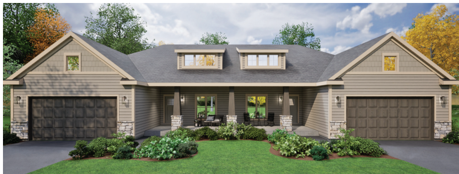
CONDO PLAN - A - RIGHT